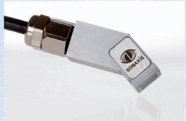
64 element 2D phased array probe