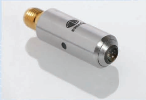
Miniature high frequency probe